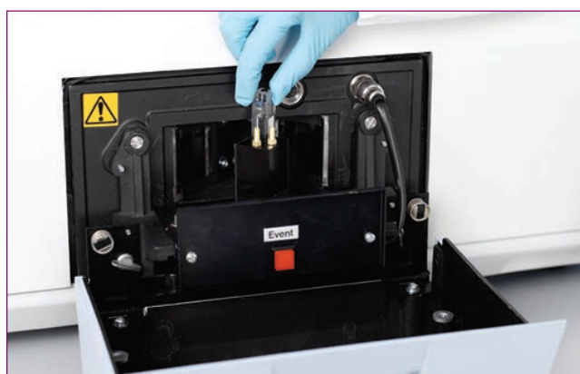
Biokinetics Accessory for LS50/45/55