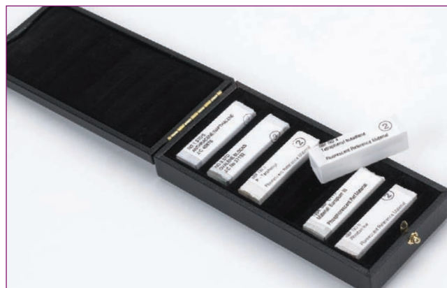
Set of six Luminescence Sample Blocks