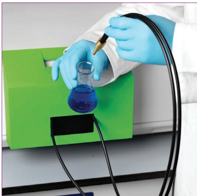
Remote Fiber-optic Accessory