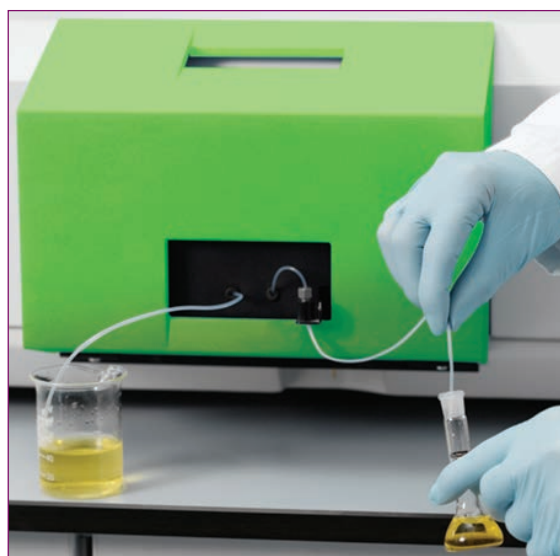
Liquid Sipper Accessory

Includes Flowcell, Peristaltic Pump, 0.4 mm FEP Inlet Tube and 0.7 mm FEP Outlet Tube. Requires installation by a PerkinElmer service engineer.