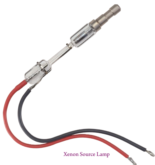
Xenon Source Lamp