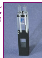
Quartz SUPRASIL Flow-through Cells for Fluorimetry (B0631126)