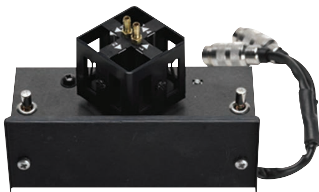
Four-position Thermostatted Automatic Cell Changer

Requires a source of liquid cooling, such as a water-circulator. Requires Accessory PCB Kit (L2250162) for use with LS-45